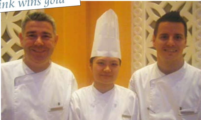
Pink with the executive sous-chef and pastry chef from the Grand Hyatt Dubai

After starting the Culinary Arts Academy (CAA) programme at Institut Hôtelier “César Ritz” in 2006, the first batch of students graduated in 2008. Here is an update from one of our CAA graduates: